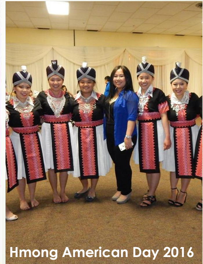
Hmong American Day 2016