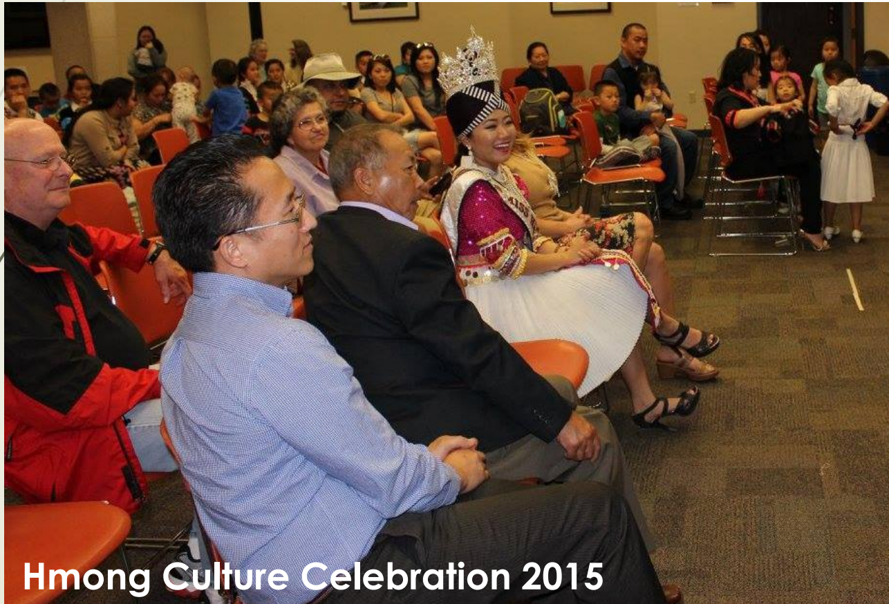
Hmong Culture Celebration 2015