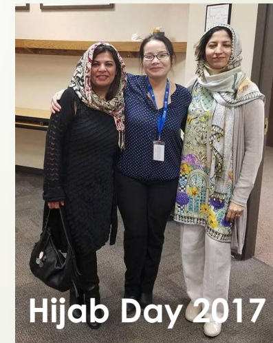
Hijab Day 2017