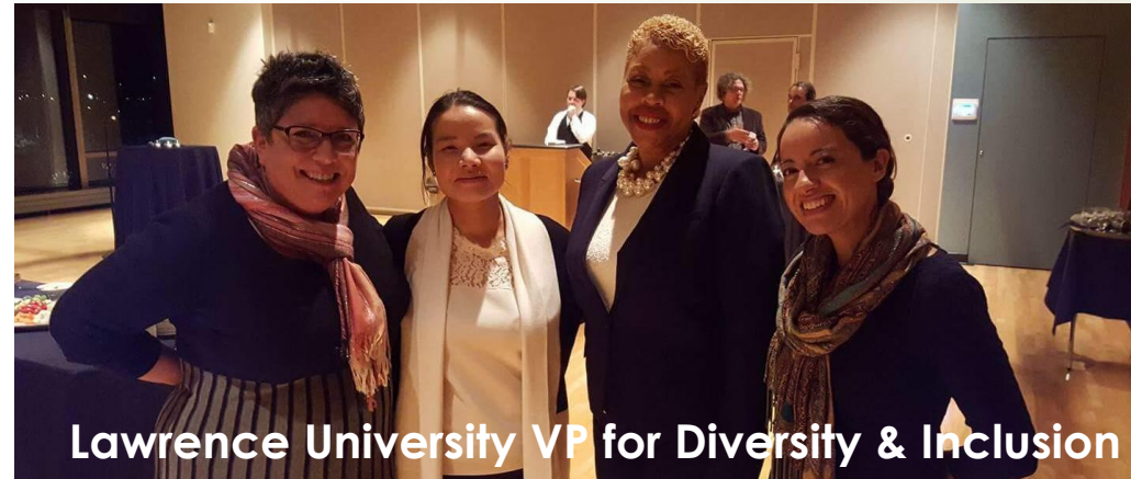
Lawrence University VP for Diversity & Inclusion