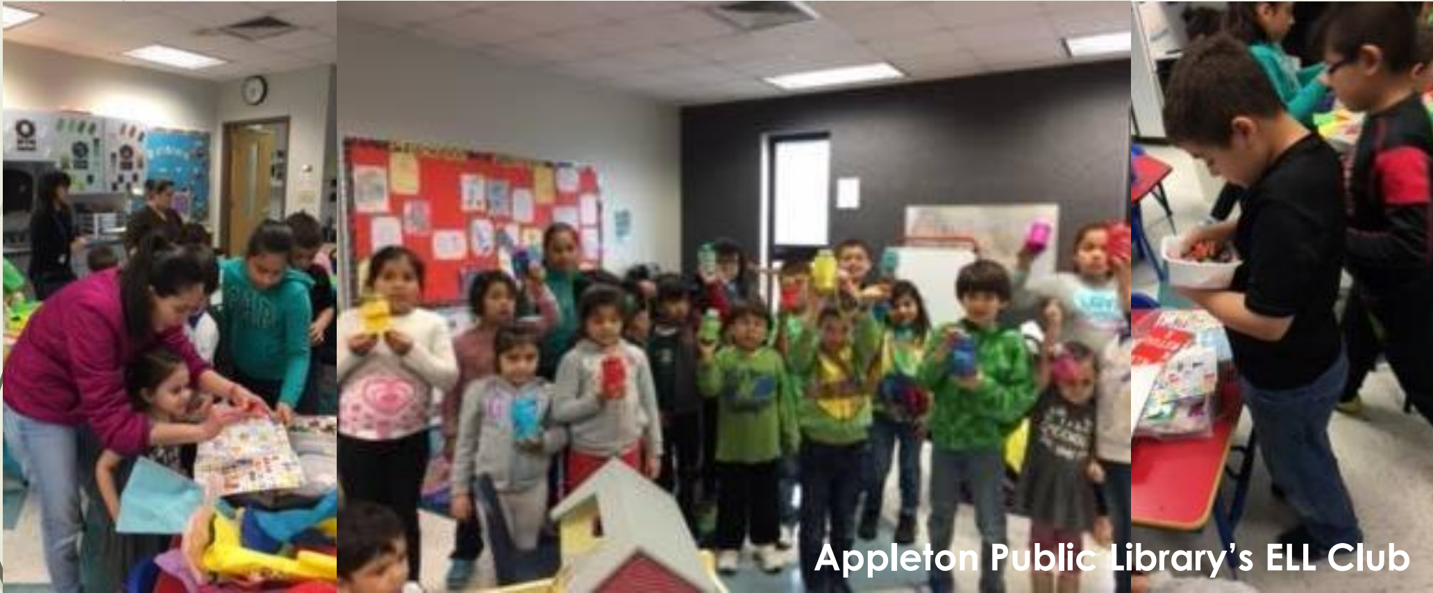
Appleton Public Library's ELL Club