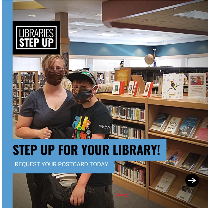
Instagram Post Template 1