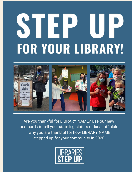
Flyer Template 2

You'll be getting a flyer with your pre-printed postcards, but feel free to customize and print these flyers with your library's pictures. Display these in highly visible areas.