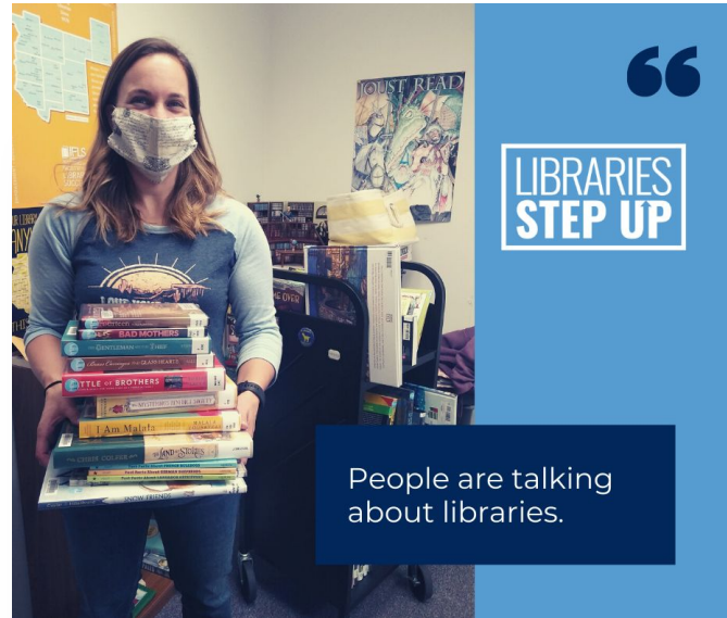
Facebook Post Template 2