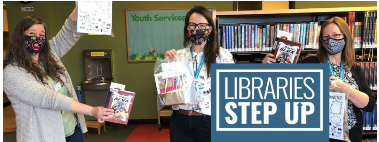
Facebook Cover with librarians Template