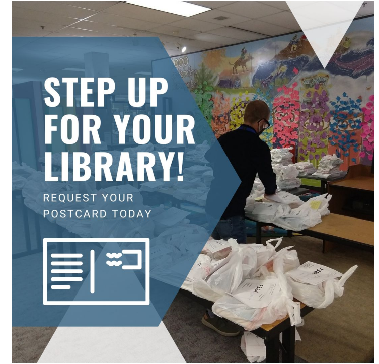
Instagram Post Template 3