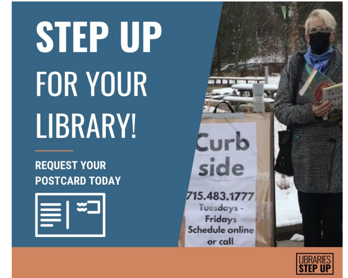
Facebook Post Template 3