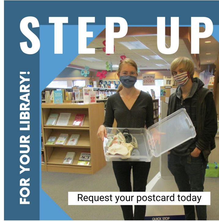
Instagram Post Template 2