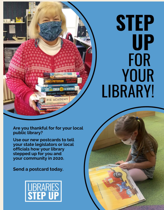
Flyer Template 1