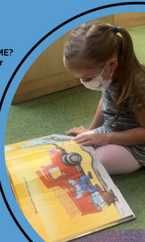
Poster Template 2

Spread the word about Stepping Up For Your Library with these 11x17 posters.