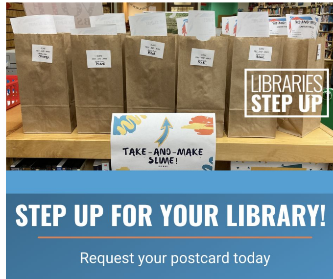
Facebook Post Template 1